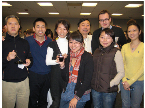
Students gather to toast the end of the Fall Semester!