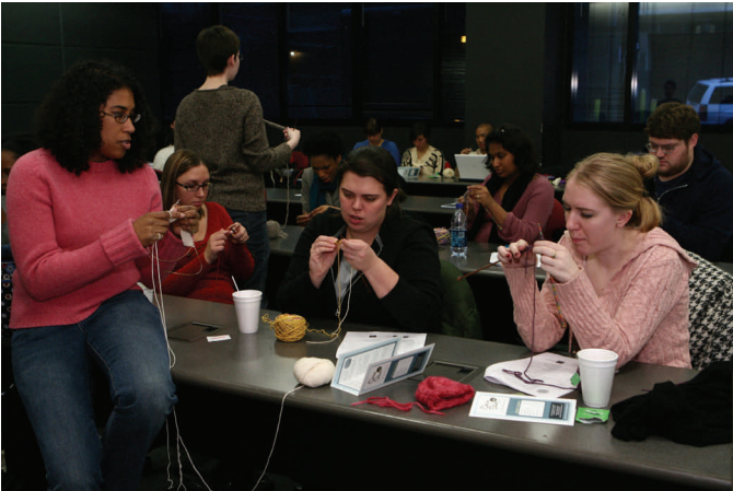
Students crochet together against global poverty

On November 23, Chicago-Kent students made caps for newborn babies to donate to “Knit One, Save One,” a grassroots initiative of the global humanitarian organization Save the Children and the Warm Up America Foundation. The project seeks to engage knitters and crocheters to take action for the 4 million babies who die each year within the first month of life in poor countries. The event was co-sponsored by the Kent Justice Foundation, International Law Society and United Nations Association of the USA .