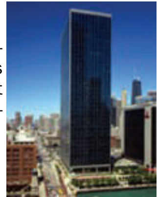
The 321 North Clark Building serves as the Chicago Office of Foley & Lardner

The students asked a lot of questions regarding the operations of a large, U.S. law firm. Specifically, firm representatives and students discussed marketing strategies, the attorney-client relationship, and how the firm controls the quality of legal services within each practice group. Overall, the LL.M. students enjoyed being able to see first-hand how a large U.S. law firm operates.