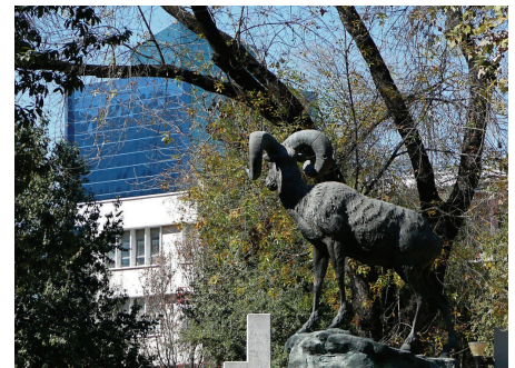
The Plaza of the Monterrey Institute of Technology Law School (Right)