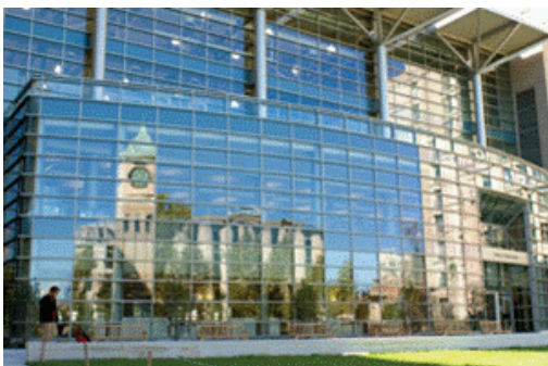
The Monterrey Institute of Technology Law Building (Left)