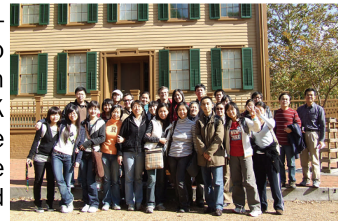
Members of CASCLE pose in historic Springfield, IL