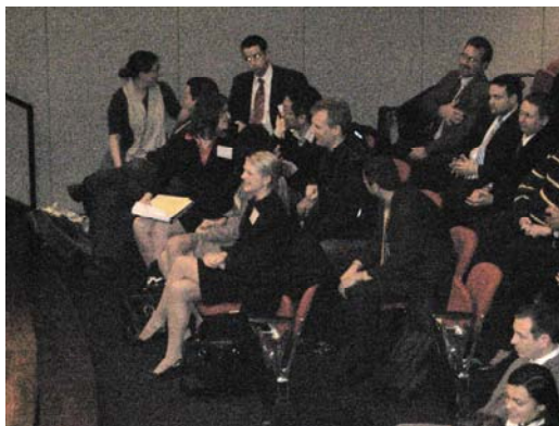
Loyola University's Team Awaits Quarterfinal Decision